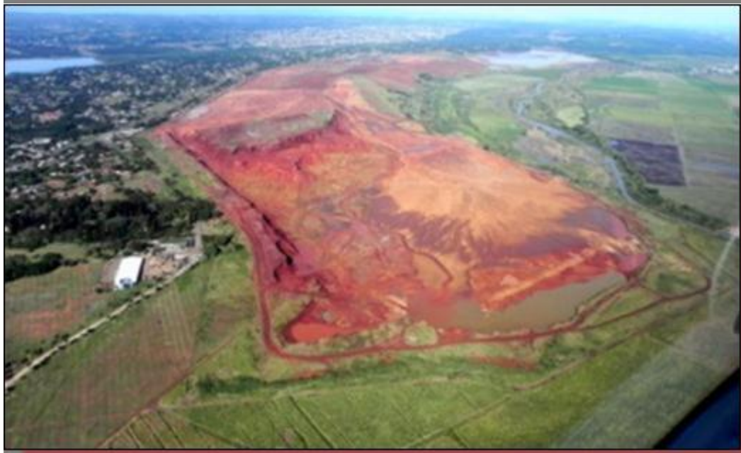
Exxaro KZN Sands Hillendale mine next to UVS and Ezikaweni settlements. This is what it will look like south of Mtunzini, and east of the N2 if the mine goes ahead.